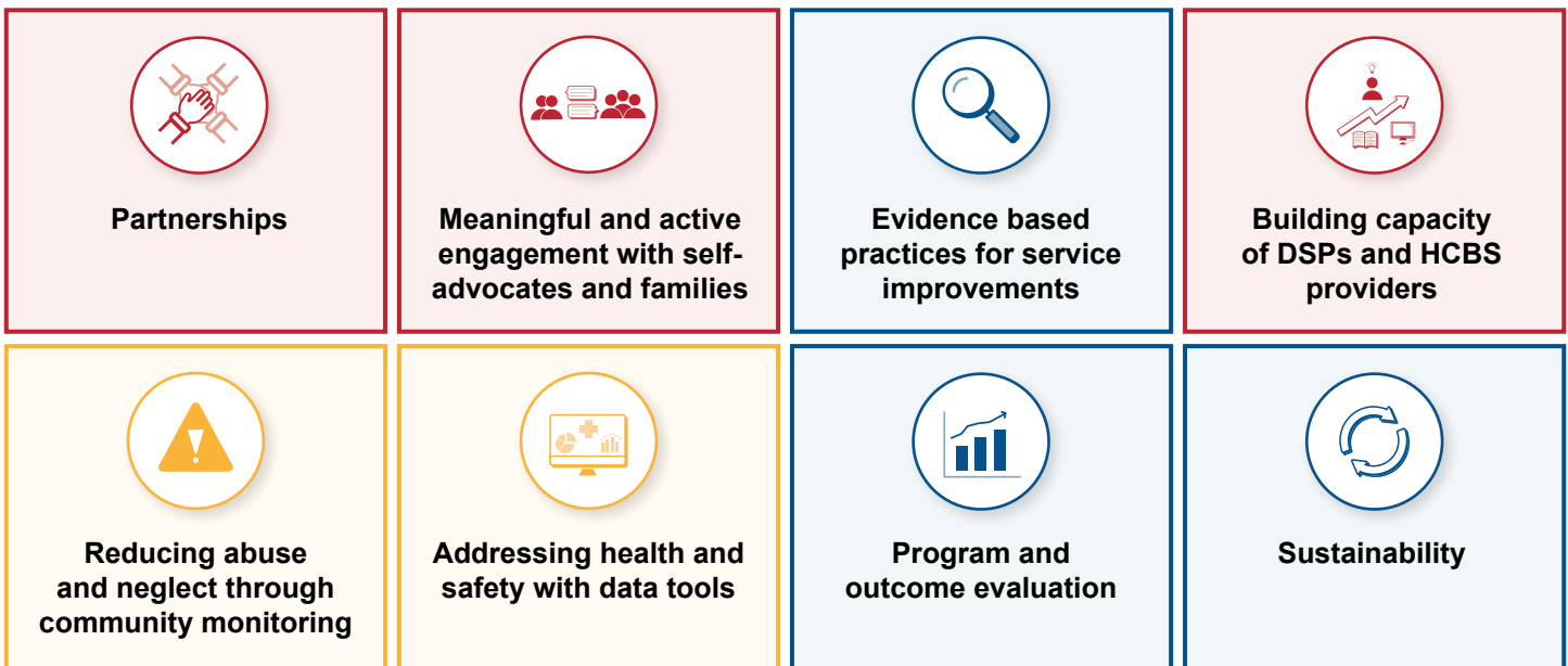
Exhibit 1. Eight Key Features of Living Well Models

Each grantee designed at least one integrated model of community monitoring and capacity building to enhance the independence, integration, health, and safety of individuals living in the community. Each model addresses eight key features specified in the funding opportunity announcement for Living Well grants (see Exhibit 1).