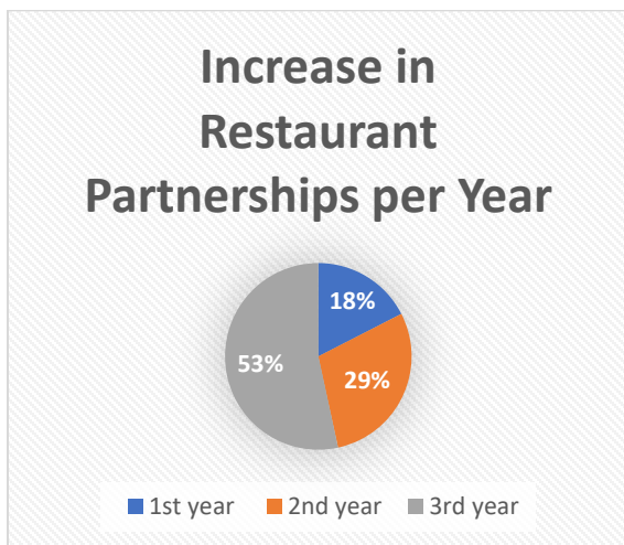
Figure A. Demonstrates the increase of restaurant partnerships per year with The Iowa Department on Aging for the grant.